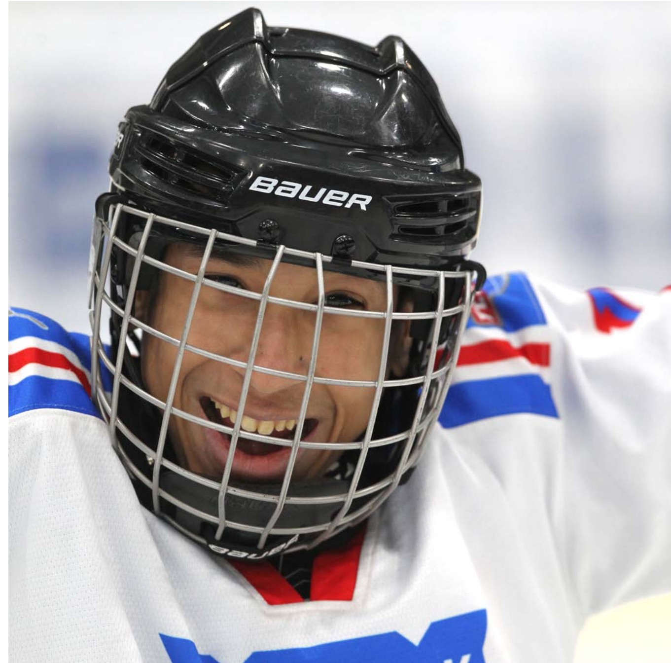
Eric Adams Mayor